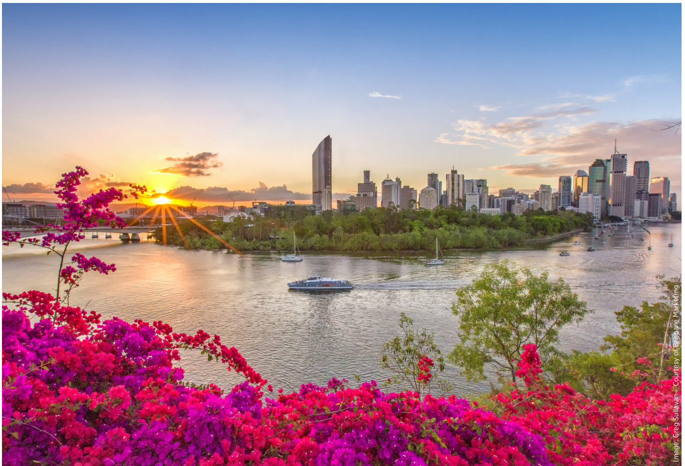
Brisbane City seen from the Kangaroo Point cliffs at sunset with a City Cat ferry.

my.uq.edu.au/student-support/accommodation and study.uq.edu.au/university-life/living-in-brisbane .