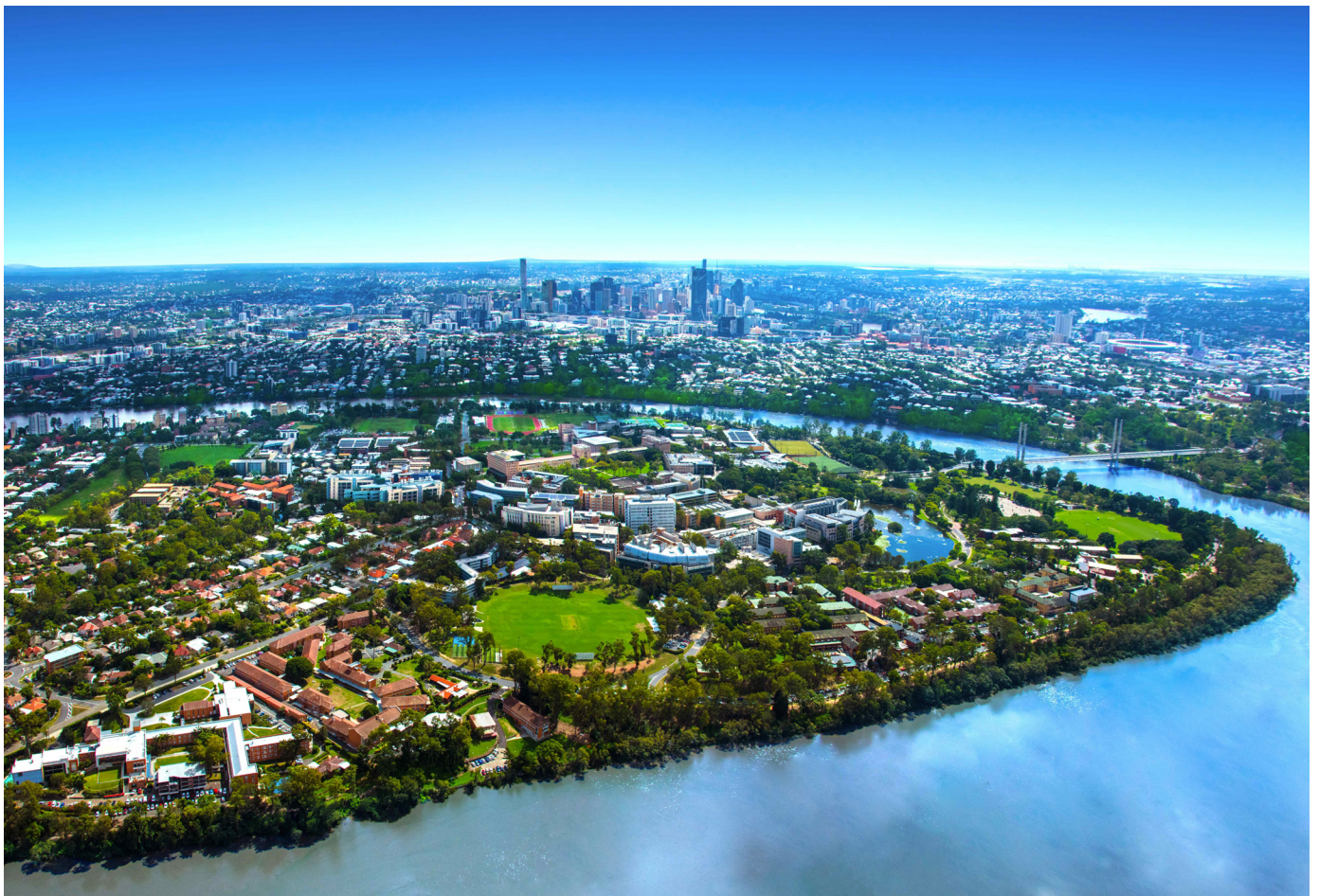
Aerial view of UQ St Lucia campus with Brisbane city in the background.